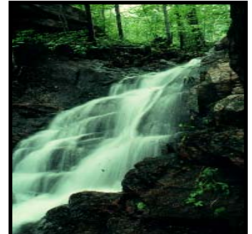
The Skagit River is our source of water.